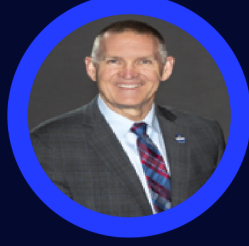
JEFFREY SMYTHE North Carolina Department of Justice